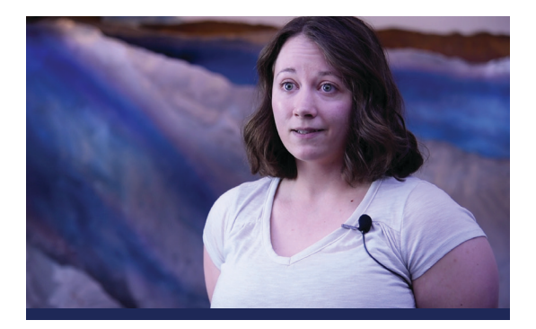
So, my husband is military, and I need a job that can travel. Cybersecurity is great. The job market is great. The pay is great. I feel like I can find a job anywhere.